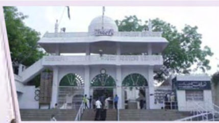
Khaja Banda Nawaz Dargha