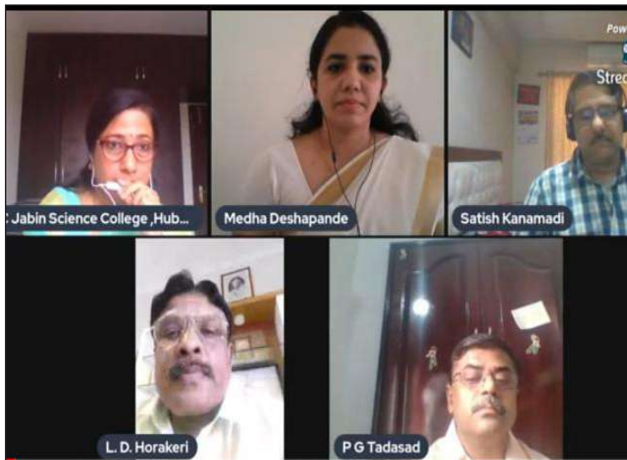
KLE Society's P C Jabin Science College - Workshop On 'Ethical Issues In Resea...